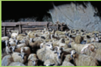
Tor za ovce u velebitskoj špilji. A sheepfold in a Velebit cave.