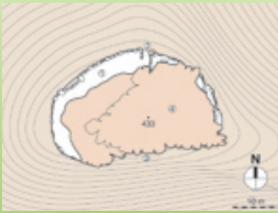
Tlocrt gradine na vrhu Velikog Vitrenika: 1 suhozidni bedem, 2 ulaz, 3 rub strme padine, 4 živa stijena Plan of the hillfort on the summit of Veliki Vitrenik: 1 drystone rampart, 2 entrance, 3 edge of the steep slope, 4 bedrock

Oko mnogih gradina nalaze se grobovi brončanodobnih i željeznodobnih moćnika koji su gospodarili ovim krajem. Pokopani su pod velikim, okruglim kamenim gomilama, u grobnim skrinjama od kamenih ploča. Većina gomila davno je raskopana, a grobovi su opljačkani. Nekoliko takvih grobnih gomila nalazi se na sjevernom rubu Starigrada, u predjelu zvanom Matkovača.