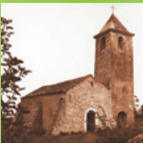
Crkva sv. Petra - 10. st St. Peter's Church - 10th century