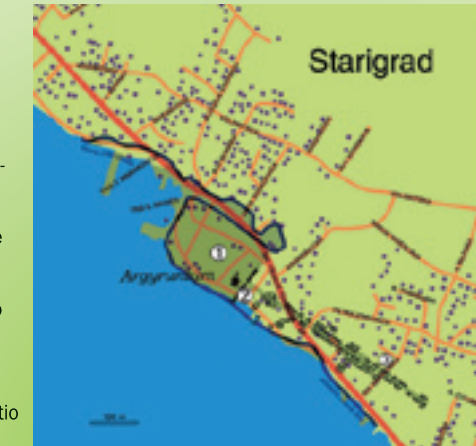
Pod središtem Starigrada kriju se ostaci rimskog Argyruntuma: 1 jezgra rimskog grada, 2 gradski bedem, 3 rimska cesta i groblje Remains of the roman Argyruntum lurk underneath the center of Starigrad: 1 Roman town, 2 town wall, 3 Roman road and cemetery

Sudeći po nalazima iz groblja, život u Argyruntumu zamro je početkom 4. stoljeća po Kristu. Razdoblje mira poremetile su provale "barbarskih" naroda koje su na kraju dovele do propasti nekad moćne rimske države. Posljednji pokušaj da se jadranska obala vrati u sastav Carstva pripao je istočnorimskom caru Justinijanu. Sredinom 6. stoljeća po Kristu on je dao sagrađiti sustav utvrda za osiguravanje plovidbe i zaštitu obalnog stanovništva. Ruševine bedema i kula nad Modrićem istočno od Selina, te kod Svete Trojice nedaleko Tribnja, dio su tog obrambenog sustava koji je tek nakratko odgodio konačni slom antičkog svijeta na Jadranu.