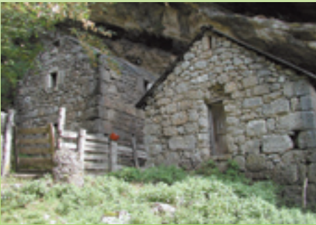
Kuće u stijeni - Ramići u NP Paklenica Houses under the cliff

Ovakva sezonska kretanja stada i pastira traju već tisućama godina, od početka neolitika. Vrijeme i erozija gotovo su posve izbrisali tragove tadašnjih skromnih nastambi i torova, no u kršu postoji mnoštvo špilja koje su također služile kao zaklon za ljude i stoku. U samom Nacionalnom parku i njegovoj neposrednoj okolini ima ih dvadesetak. Često su zagrađene suhozidima, a u neke od njih mogla su stati povelika stada ovaca i koza. Arheološke naslage koje su se u njima nakupile čuvaju rječite materijalne ostatke - brojne kosti domaćih životinja, te istrošene alatke i pribor pretpovijesnih pastira. Naročito su zanimljivi ulomci različito oblikovanog i ukrašenog zemljanog posuda. Lončarski stilovi s vremenom su se mijenjali pa zahvaljujući tome možemo približno odrediti vrijeme korištenja pojedinih špilja.